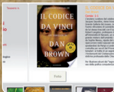
Product detail with video

Leonardo Model: Capability of: 650 trays