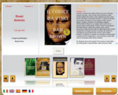
Products selection software